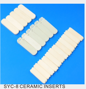
SYC-8 CERAMIC INSERTS SYC-9 PLASTIC PRESS INSERTS