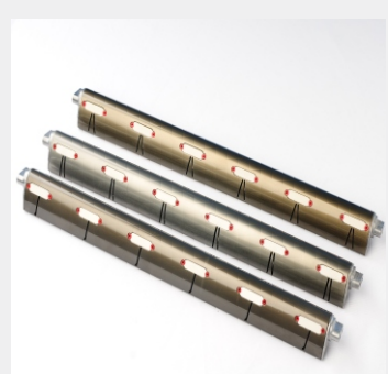
SYC-7 Elite Tube